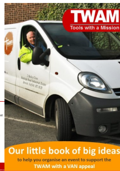
Fundraising ideas booklet

We have produced lots of resources to help you, including posters, leaflets, invitation cards and a talk you can use. You can order them by email, phone or post. We're so grateful for your support and any help you can give us.